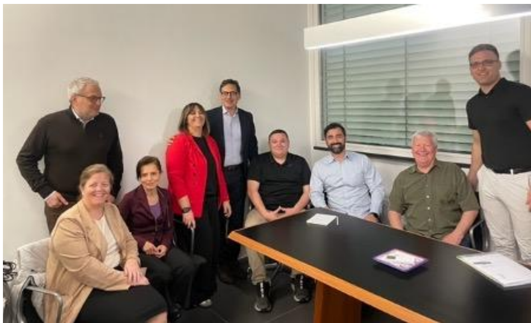
USDBC Trade Team Meets with La Doria in Italy

In March, 2024 USDBC led two successful trade teams to the UK and Alimentaria (Spain)/ Italy. These are the first two missions led by USDBC's new London office. Reports from the UK trade mission note the importance of USDBC's presence in the UK and the need to increase communications with the trade. A separate group traveled to the Alimentaria Expo in Barcelona and continued on to meet with buyers in Italy as well as a stop to WFP in Rome. Italian buyers also expressed their interest and commitment to the US dry bean offers. Detailed trade reports available upon request.