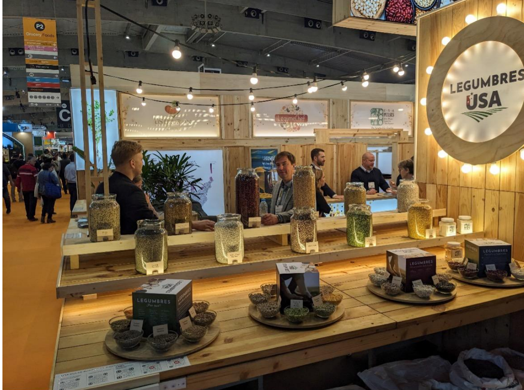
Joint Pulses booth at Alimentaria, Barcelona

In March, 2024 USDBC led two successful trade teams to the UK and Alimentaria (Spain)/ Italy. These are the first two missions led by USDBC's new London office. Reports from the UK trade mission note the importance of USDBC's presence in the UK and the need to increase communications with the trade. A separate group traveled to the Alimentaria Expo in Barcelona and continued on to meet with buyers in Italy as well as a stop to WFP in Rome. Italian buyers also expressed their interest and commitment to the US dry bean offers. Detailed trade reports available upon request.